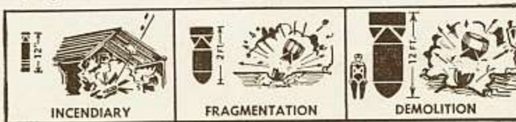
TYPES OF BOMBS AND THEIR EFFECT

High explosive bombs vary in size, weight and effect and may be either of the fragmentation or demolition type. Their effects are impact, earth shock, blast, fragmentation and fire. The best way to defeat them is to obey all the rules of blackout and air raid precautions both before and after a raid. Beware of unexploded bombs; they may be time bombs; report their location to the nearest authority.