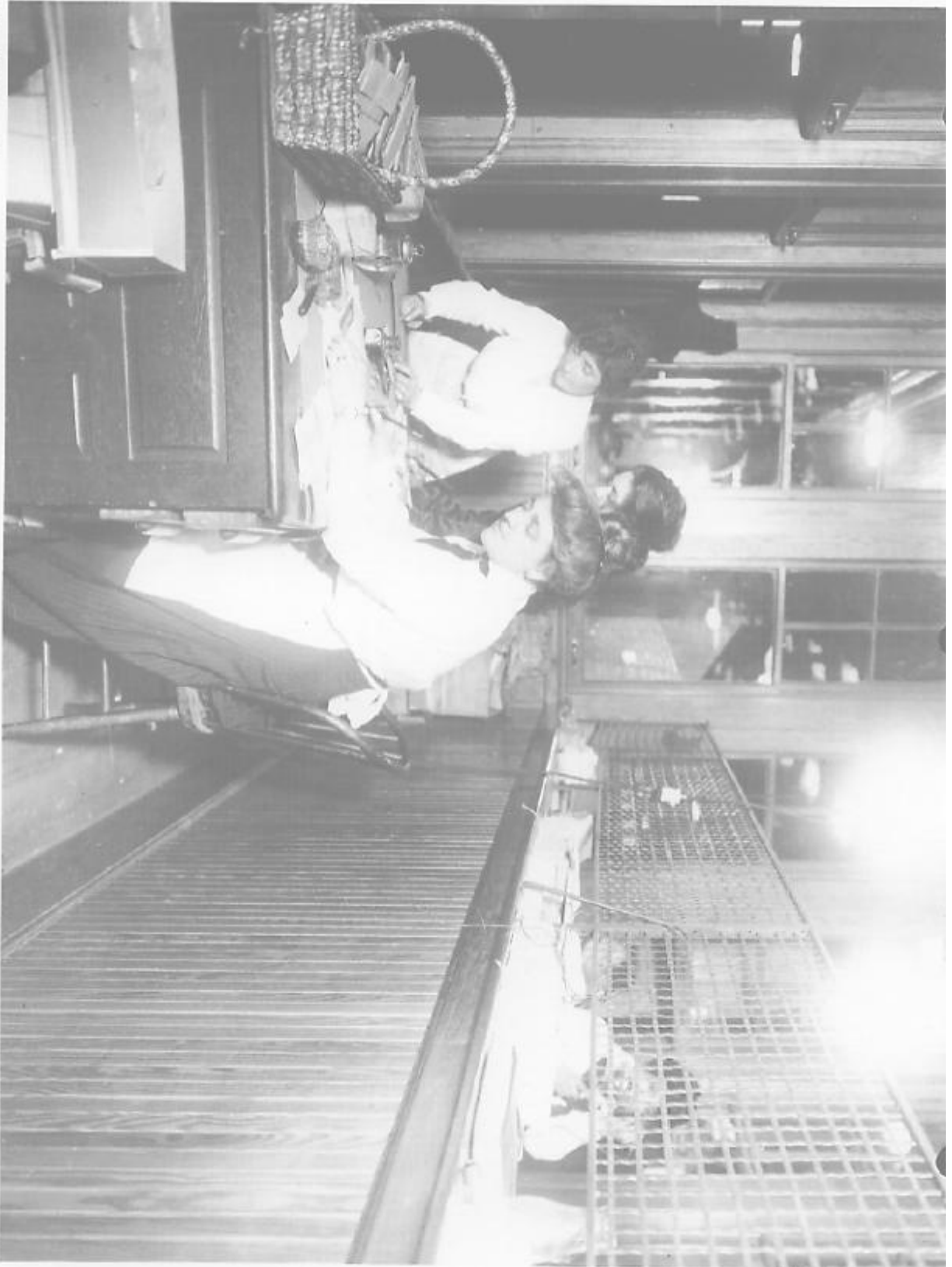
2.47 Women workers