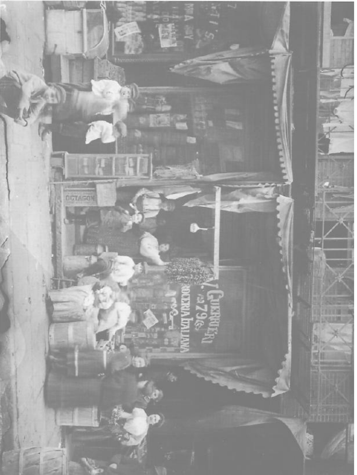
2.30 Immigrant neighborhood