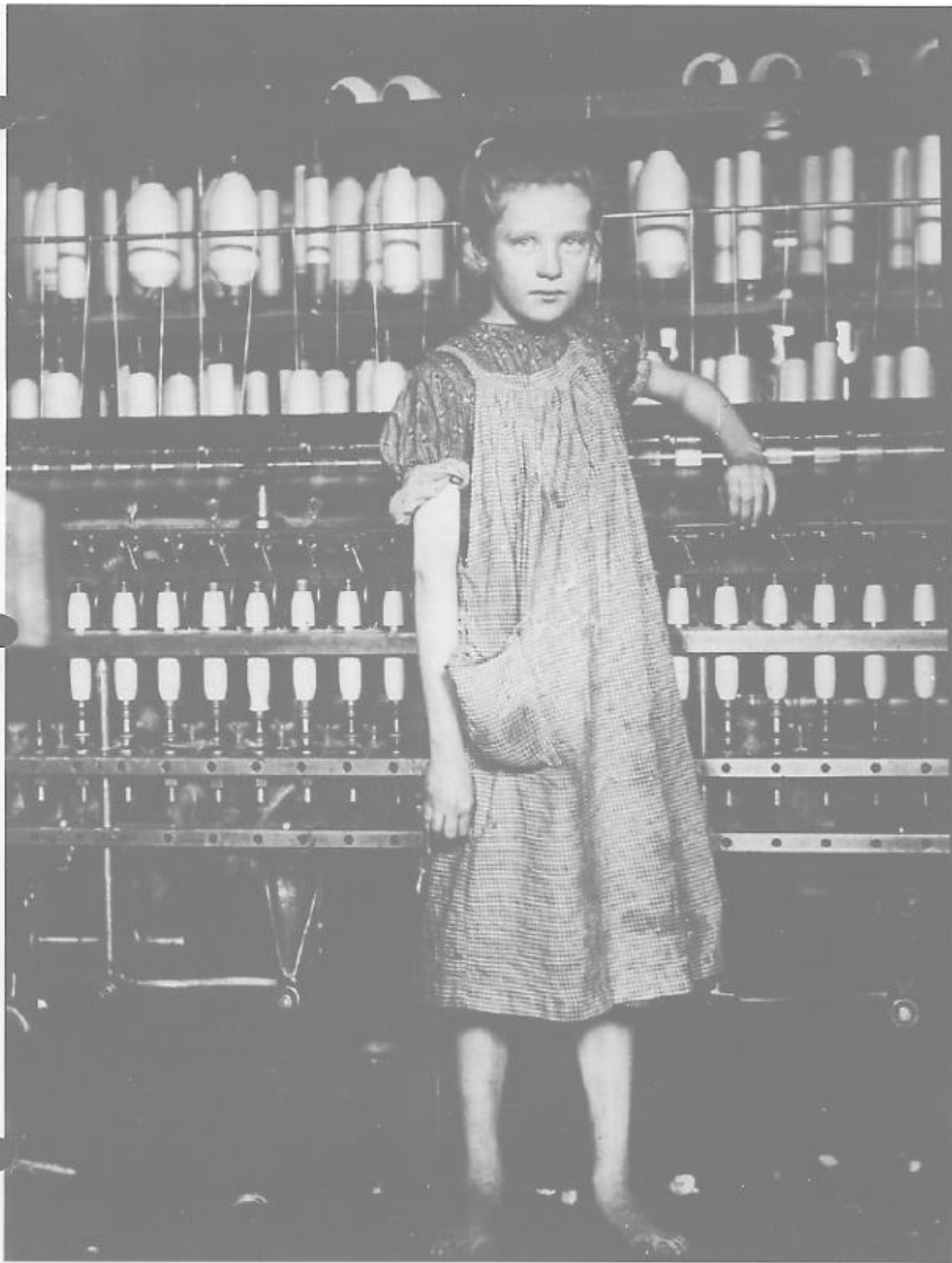
2.42 Child laborer