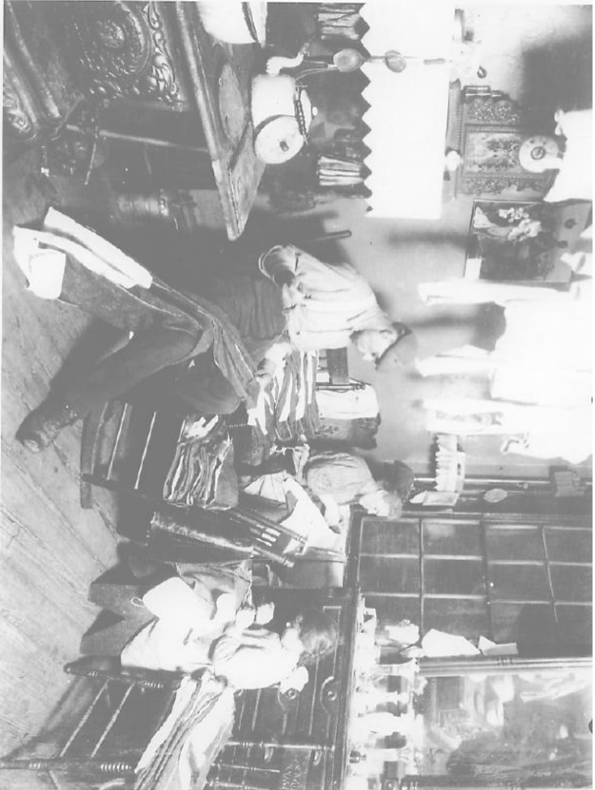
2.33 Immigrants sewing