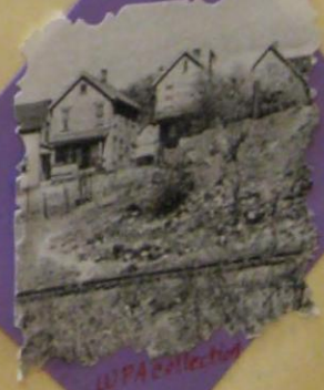
U.S. PA Collection