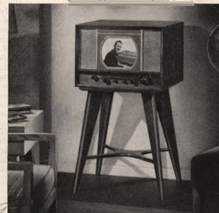
METROPOLITAN Television Receiver with 10-in. picture tube. $299.50. Matching table optional. $35.00.

Prices subject to change without notice.