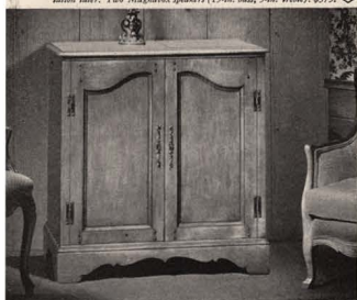
MODERN SYMPHONY CONSOLE Television Receiver. Magnascope with 10-in. tube. $395.